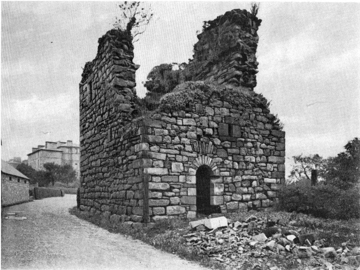
Figure 1: Craiglockhart castle as it appeared in the early 1960s. 2

The tower is believed to have been built in the 15 th century and was an oblong structure of four storeys in height with walls 5 feet thick at base and measuring 28.5 feet from north to south and 24.5 feet east to west. The entrance was on the north side and opened to a vaulted chamber suitable for two floors. A fireplace was built into the west wall. Corbels in the walls served as footings for a hall floor. Adjacent to the entrance was a wheel staircase that gave access to the hall floor and another upper vaulted chamber . 1